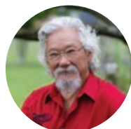
Morning Keynote Speaker